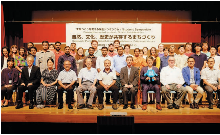
Student symposium at Tsubakikaikan Music Hall, Kure-City, August 25th 2019