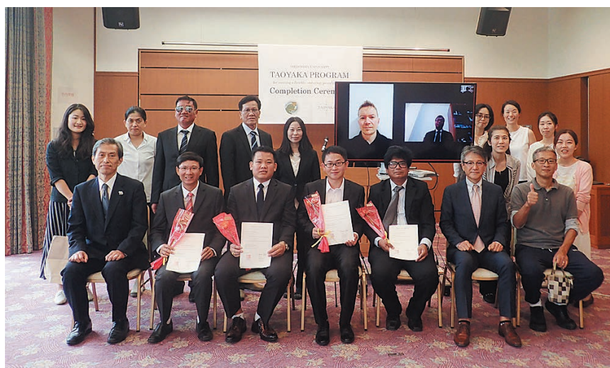
Graduates with their family, supervisors and staff

Six students were completed both their graduate schools and TAOYAKA program at this time. They were admitted as the TAOYAKA Program students in April or October 2014 and April 2015. Students worked a wide range of interdisciplinary course work on and off campus such as Onsite Training or Onsite Team Project through Taoyaka Program and developed their abilities.