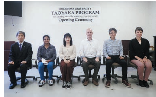
New students and their supervisors

as one of the Program's three courses. The students are required to take courses not only from their own graduate schools but also from the Program's unique subjects called "Multicultural Coexistence Practical Subjects" and "Reverse Innovation Practical Subjects" in order to gain broad range of knowledge and skills to be used in multidisciplinary research and