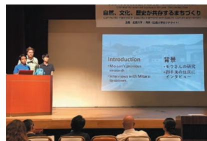
Student presentation at the symposium