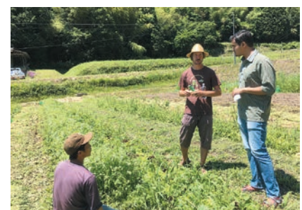
In the field