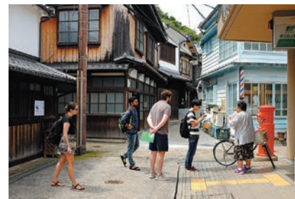
Interview with local people

under the Taoyaka Program. Thankfully, the City Mayor of Kure attended the presentations made by the students.