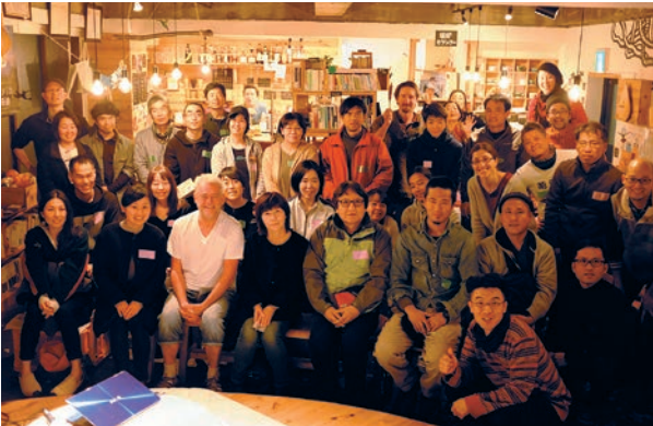
With participants at the workshop